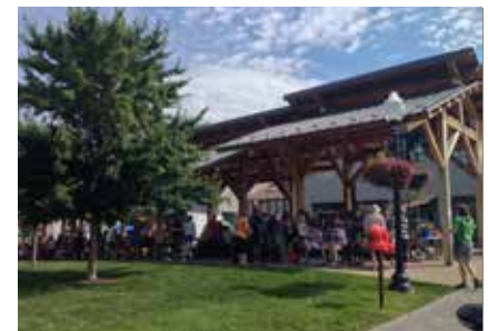
Covered Market Shelter Example