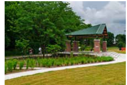
Potential Amphitheater Design