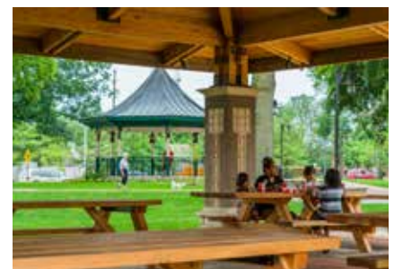
Art Square Example

up to 1,000 spectators. School parking lots can provide overflow parking when events occur during non-school hours, which are likely most event times (i.e. evenings and summer).